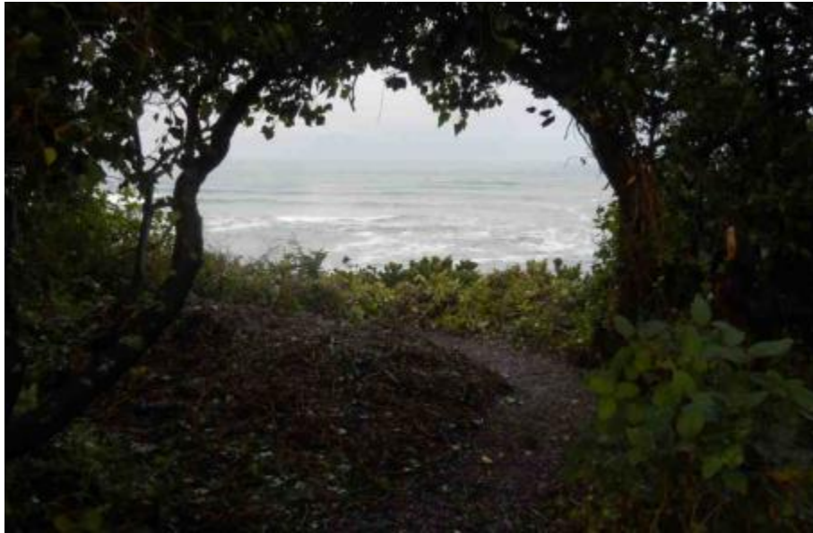
Graham Street Scenic Lookout Trail