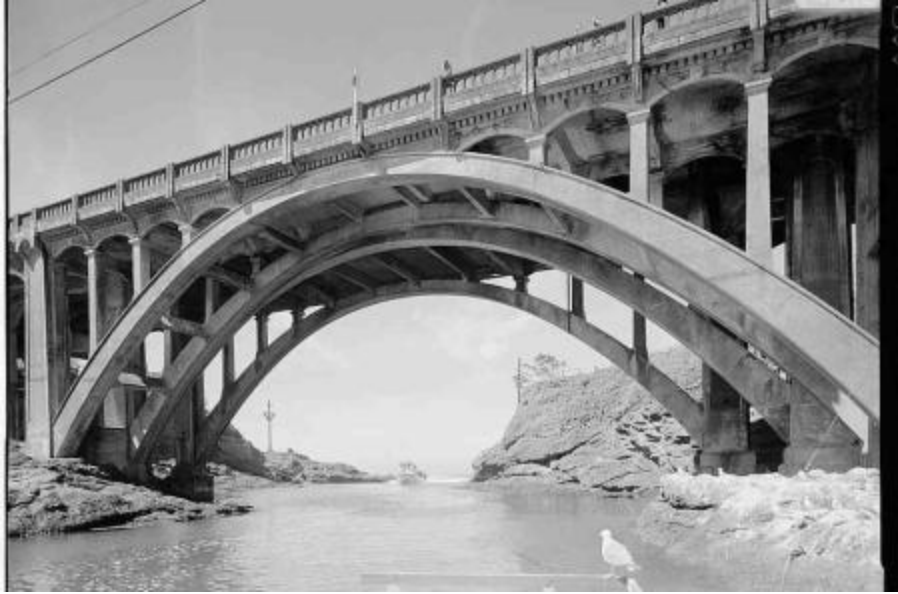
History of City Landmarks