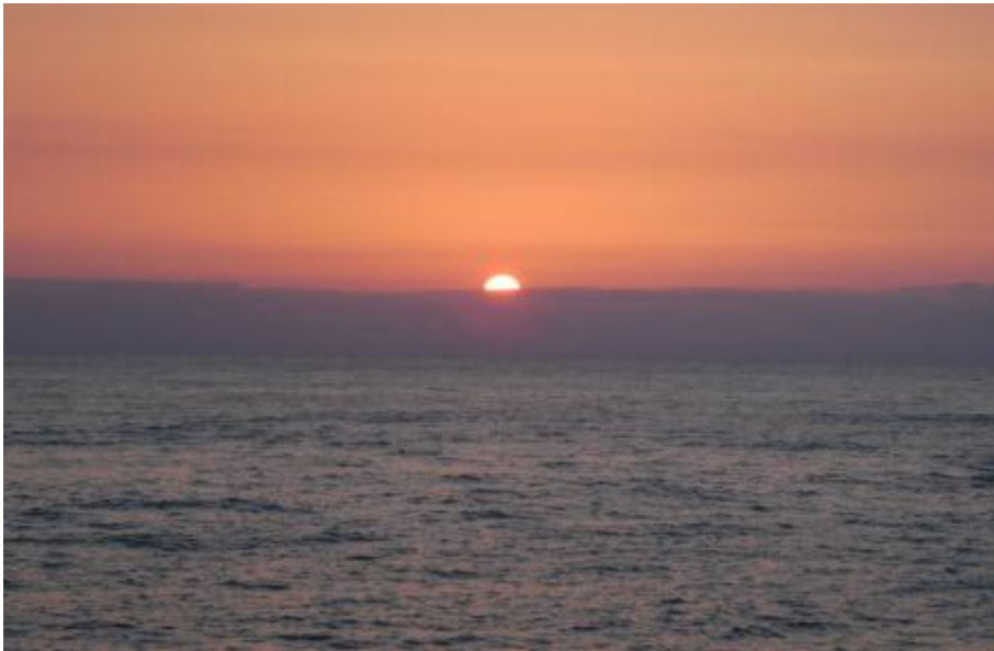
The Fleet of Flowers