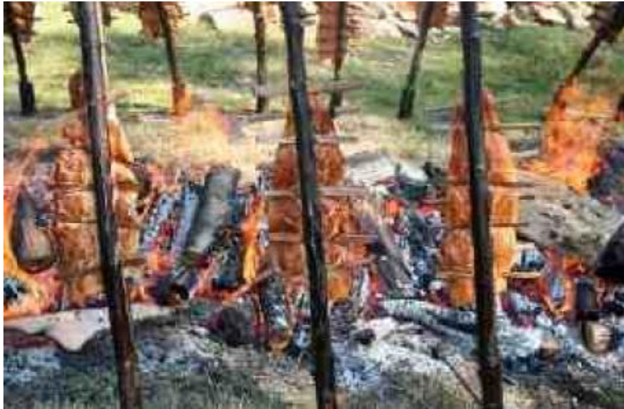
The Early Salmon Bakes