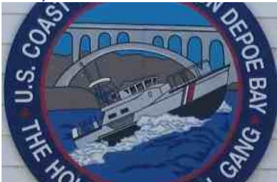
Bringing in the Coast Guard